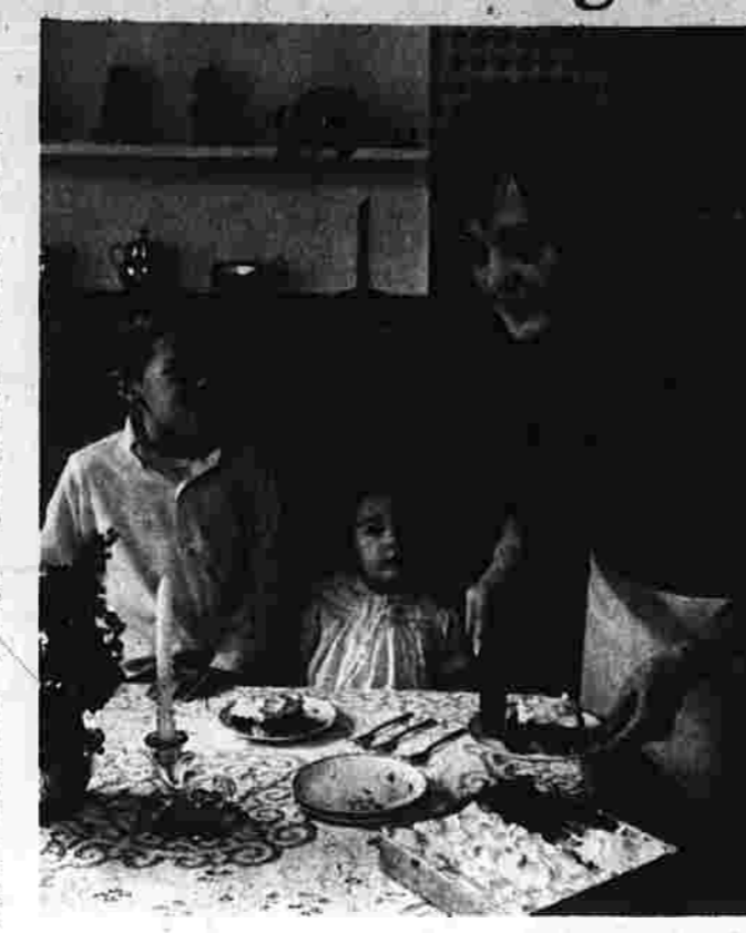
MRS. PYKA AND CHILDREN