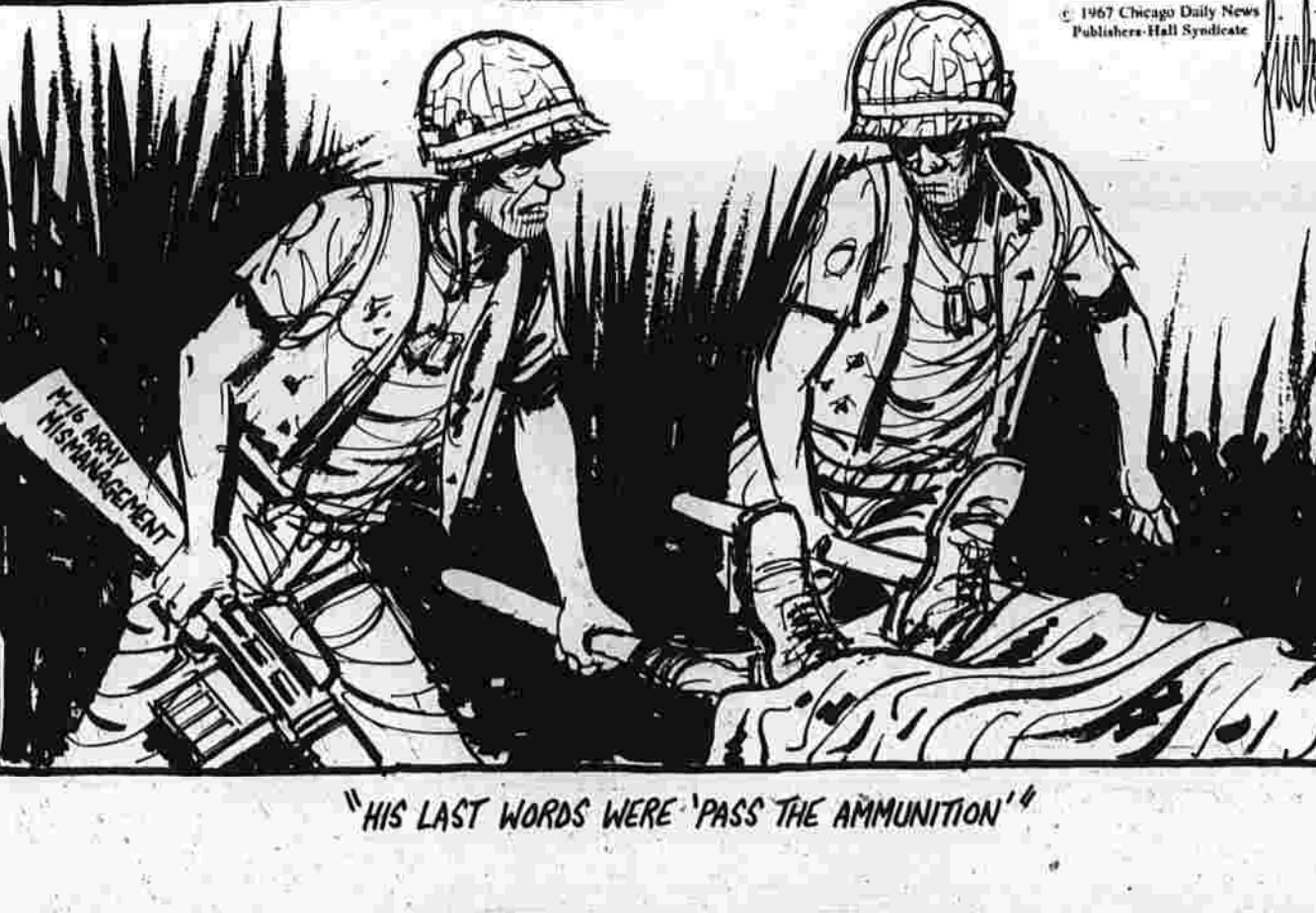
Fischetti HIS LAST WORDS WERE 'PASS THE AMMUNITION'

Official Washington and, indeed, the American system itself acquiesced themselves in the face of protests, defamations, and rank abuse during the week-end's so-called anti-war demonstrations in the capital.